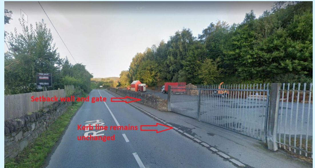
Figure 2 - Proposed works along the R-764