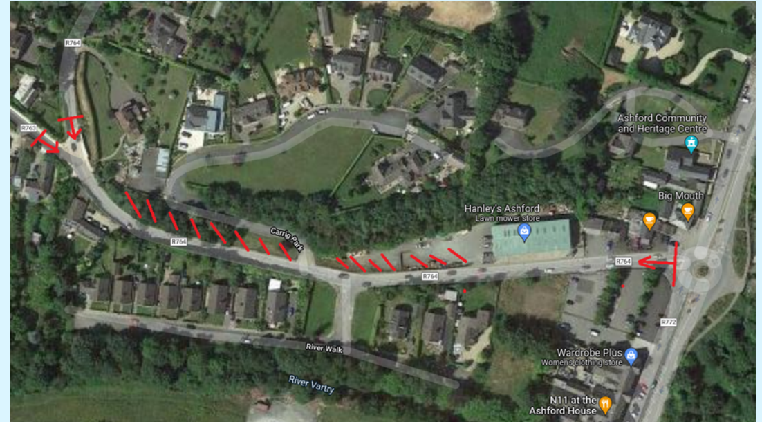
Figure 1 - Project Location Map